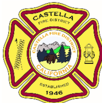
Table 1: Castella Fire Protection District

The Castella Fire Protection District (Castella FPD or District) is an independent special district located in northwestern Shasta County along Interstate 5 and the Sacramento River. The District works in conjunction with the City of Dunsmuir Fire Department and the Dunsmuir Fire Protection District to provide fire, rescue and emergency services. Dispatch is provided by the Yreka Interagency Command Center in Siskiyou County. Shasta LAFCO completed a MSR and SOI update in 2014 and this report serves to build upon that service review and update.