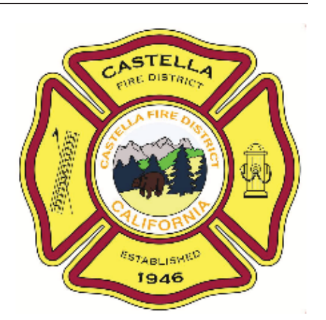
Table 1: Castella Fire Protection District

The Castella Fire Protection District (Castella FPD or District) is an independent special district located in northwestern Shasta County along Interstate 5 and the Sacramento River. The District works in conjunction with the City of Dunsmuir Fire Department and the Dunsmuir Fire Protection District to provide fire, rescue and emergency services. Dispatch is provided by the Yreka Interagency Command Center in Siskiyou County. Shasta LAFCO completed a MSR and SOI update in 2014 and this report serves to build upon that service review and update.